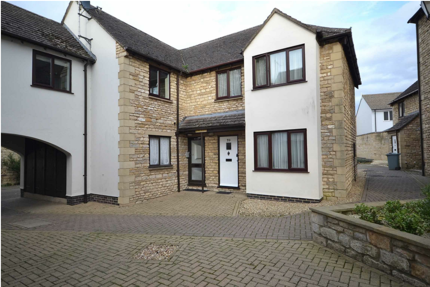
40 Phillips Court, Stamford, Lincs, PE9 2EE